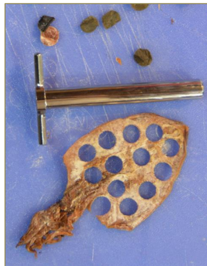
Figure 1. 'Squidpop' baits are discs cut from mantle of dried squid using a cork borer or auger punch.