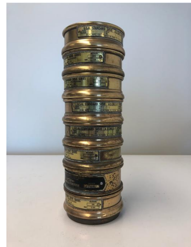
Figure 2: Example of sieve tower used to obtain size-fractionated epifaunal abundances.