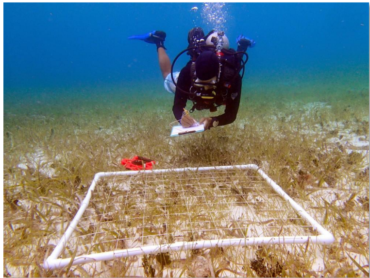
Figure 3: Diver recording seagrass cover within a quadrat divided into sections using string.

This MarineGEO module produces data on seagrass percent cover, species composition, and shoot density obtained non-destructively by an observer using a quadrat of specified size.