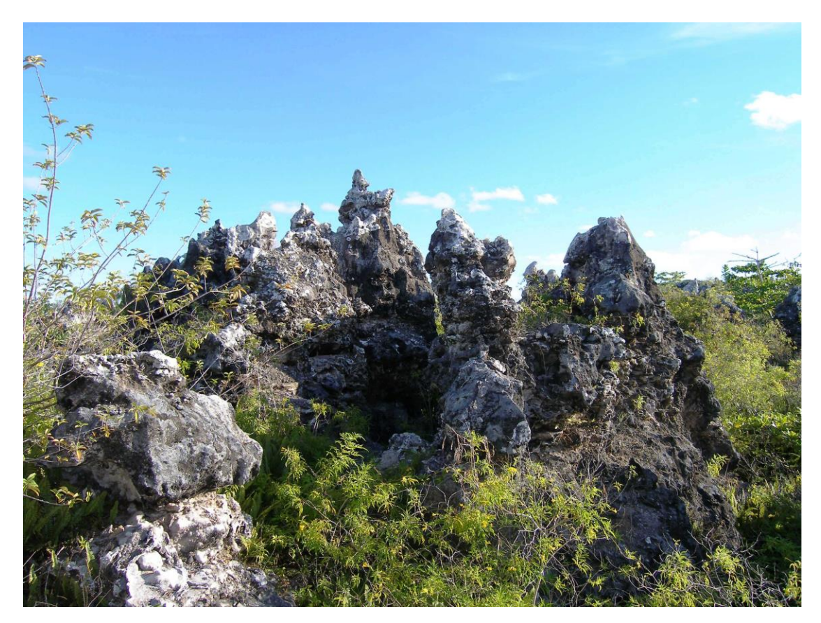
Figure 10. Sparsely vegetated impoverished pit-and-pinnacle moonscape in a mined out area of central Banaba showing little regeneration of original vegetation over forty years since the cessation of mining.

At the time of our visit to Banaba in 2005, the resident population was reportedly 301 (dropping to 295 in 2010). Of these 165 were Banaban, 125 from other islands of Kiribati and 5 from other Pacific Islands (Office of Te Beretitenti 2012). All were reportedly living mainly in three villages (Tabwewa, Antereen [also called Tabiang], and Uma), located along the coast and accessed by a modern coal tar road. A fourth village, Buakonikai (Te Aonoanne) "has been totally mined out leaving a mere plot amidst the rising pinnacles" (MISA 2008). There is no airstrip on the island and no scheduled boat service, with highly irregular transport to and from Banaba by charter vessel. When ships fail to arrive, the island runs short of imported foodstuffs, such as rice, sugar and flour, and other essential supplies including fuel. Finally, although still very attached to their ancestral homeland, most people of Banaban descent now live on Rabi in the Fiji Islands, where in 2010 the population was over 5,000 people who speak the Kiribati language and hold both Fiji and Kiribati passports. There are also 173 and 45 people from Banaba living on South Tarawa or other islands of Kiribati, respectively (Office of Te Beretitenti 2012).