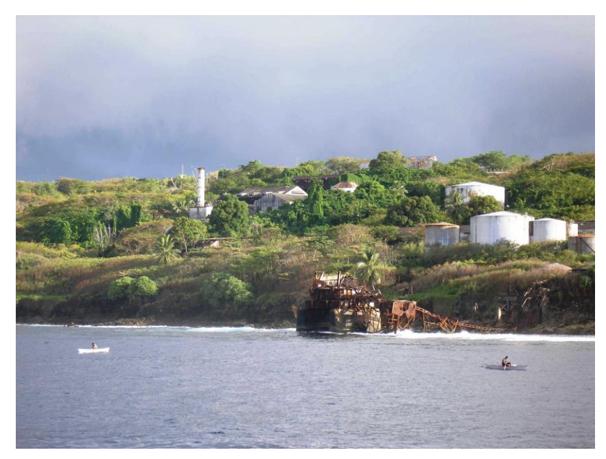
Figure 5. View of Banaba from the ocean off Home Bay showing the vegetation and the coastal limestone terraces, cliffs and escarpment rising to the central upland. Phosphate mining infrastructure remains, including the rusting cantilever used to load phosphate ships during the time of mining.