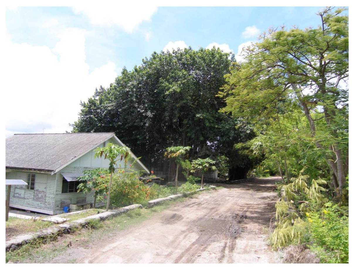
Figure 23. Scattered papaya trees ( Carica papaya ; on left of road), a spreading Indian banyan ( Ficus benghalensis ; center) and royal poinciana or flamboyant ( Delonix regia ; right) trees from the mining era in the main settlement of Tabiang, Banaba.

Other common ornamental and multipurpose plants such as coconut palms Cocos nucifera , frangipanis Plumeria spp. (Figure 24), papaya Carica papaya , common hibiscus Hibiscus rosa-sinensis , Indian mulberry Morinda citrifolia , yellow alder Turnera ulmifolia . Mexican lilac Gliricidia sepium are also common to occasional components of this vegetation type.