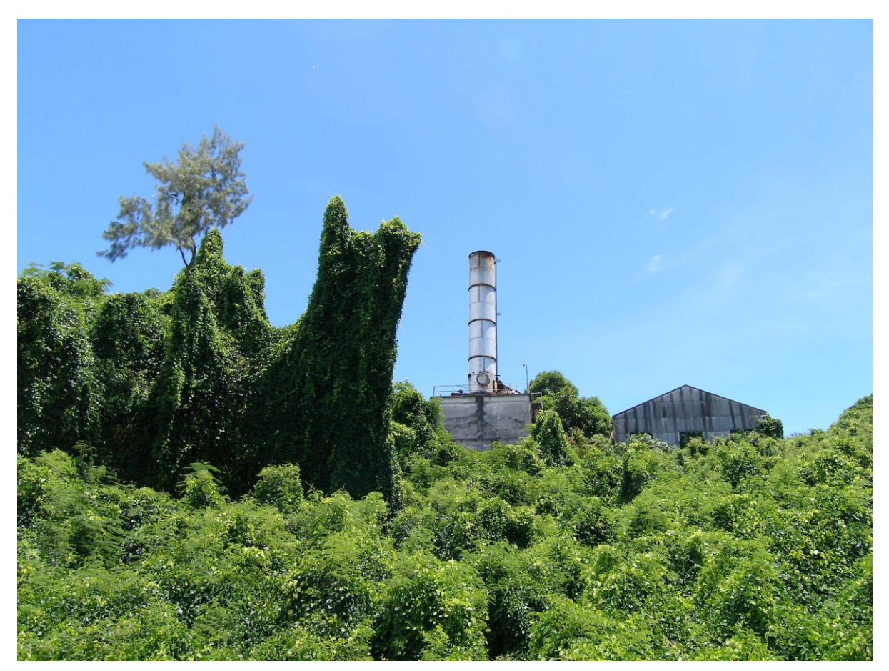
Figure 22. Indigenous high climbing vine Mucuna gigantea festooned over vegetation, including Casuarina equisetifolia trees, in the area of the abandoned calcination plant in the former mining settlement on Banaba.

One of the most distinctive, but variable, vegetation types is constituted by the houseyard and settlement gardens found in the settled areas around individual houses, in villages, around houses in the main settlement and near currently occupied housing, schools, churches and the hospital.