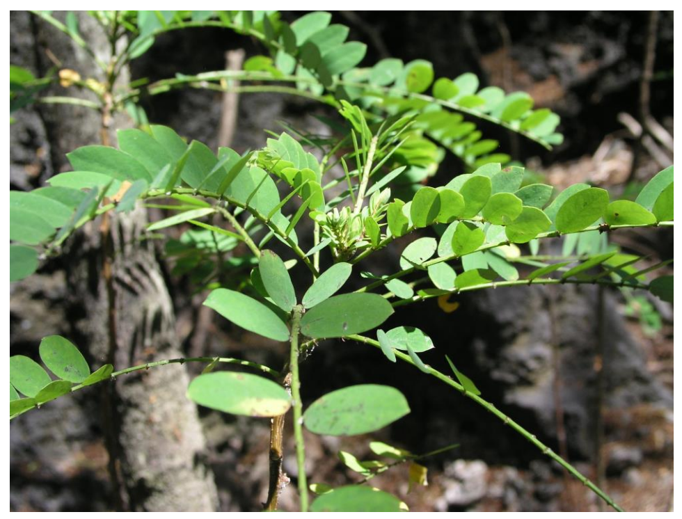
Figure 18. Small erect shrub, Phyllanthus societatis , a common understory species in inland forest and woodland on Banaba along path to the Chinese cemetery.