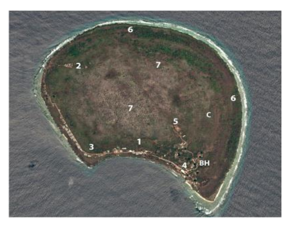
Figure 3. Map of Banaba showing (1) the main areas of settlement in the south and west of the island; (2) Fatima Village inland from Tabwewa in the northwest; (3) Tabiang Village in the southwest; (4) abandoned phosphate mining infrastructure and Uma Village inland from the southeastern part of Home Bay; (5) the sports ground towards the southwest-central part of the island; (6) the uninhabited east and north coasts; and (7) the mined central and northern parts of the island. Banaba House is denoted as BH, the cemetery as C.