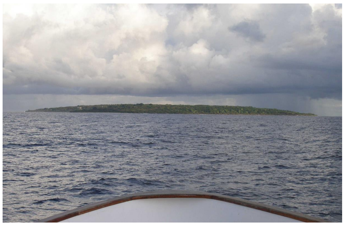
Figure 4. First view of Banaba, from the east, from the Summer Spirit , on the morning of 29 September 2005. The island looks like an upside down canoe or, as Teaiwa (2015) said when seeing her ancestral homeland for the first time on the horizon, "the gentle hump of a turtle floating on the ocean."

Figure 3. Map of Banaba showing (1) the main areas of settlement in the south and west of the island; (2) Fatima Village inland from Tabwewa in the northwest; (3) Tabiang Village in the southwest; (4) abandoned phosphate mining infrastructure and Uma Village inland from the southeastern part of Home Bay; (5) the sports ground towards the southwest-central part of the island; (6) the uninhabited east and north coasts; and (7) the mined central and northern parts of the island. Banaba House is denoted as BH, the cemetery as C.