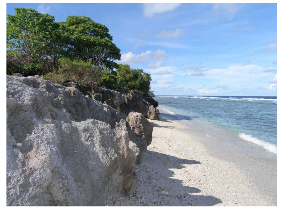
Figure 15. Uplifted limestone terraces and coastal vegetation dominated by te ngea ( Pemphis acidula) and te ren ( Tournefortia argentea ) encircled by a subtidal fringing reef in the Uma area on the southeast coast of Banaba.