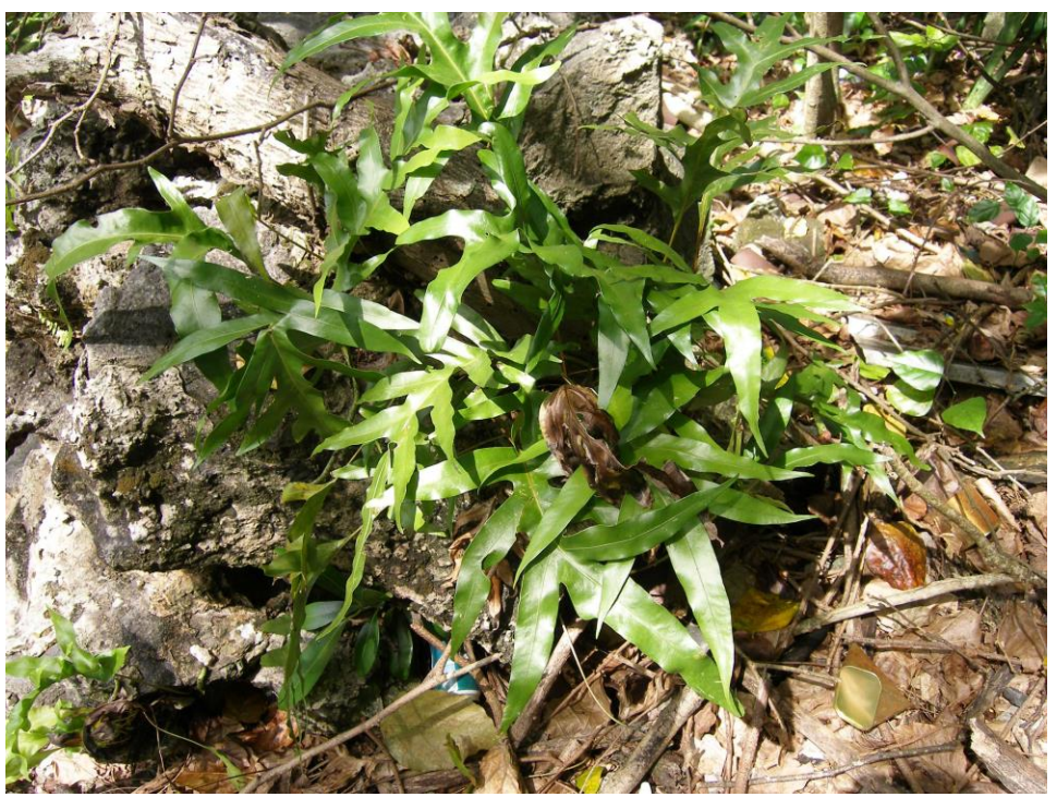
Figure 19. The fragrant fern te keang ni Makin Microsorum grossum , common in understory vegetation in open and open-shaded sties.