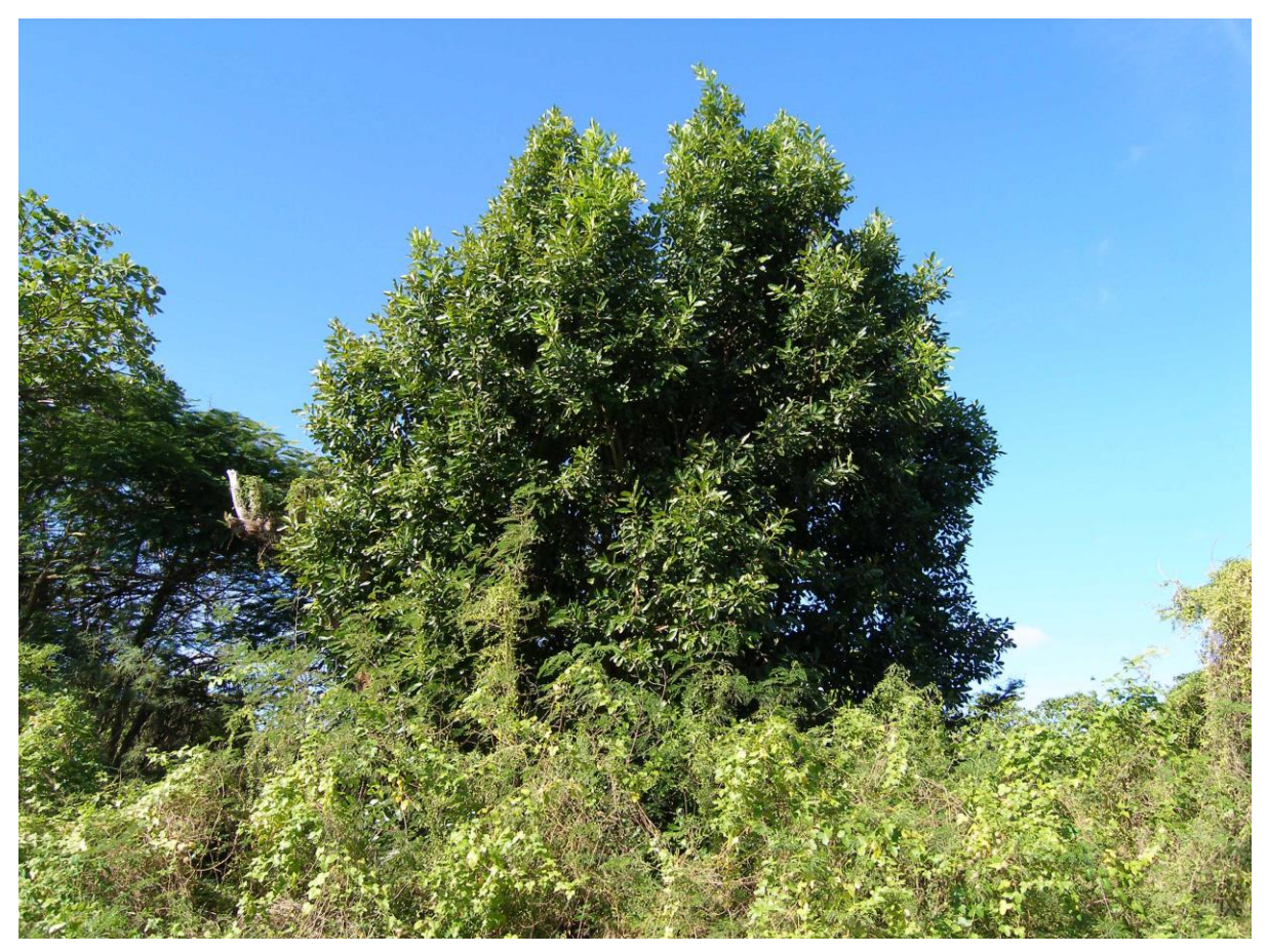
Figure 17. Calophyllum inophyllum te itai at the top of escarpment in mined area inland from the hospital. Formerly the dominant tree in the pre-mining inland forest of Banaba.

The dominant introduced plants include Leucaena leucocephala , Delonix regia and Tecoma stans (Figures 20 and 21). Uncommon is the occasional coconut palm, possibly deliberately or accidentally dispersed into these areas by local inhabitants. The Javanese flat sedge te titania Cyperus javanicus is uncommon on open sites in between limestone outcrops.