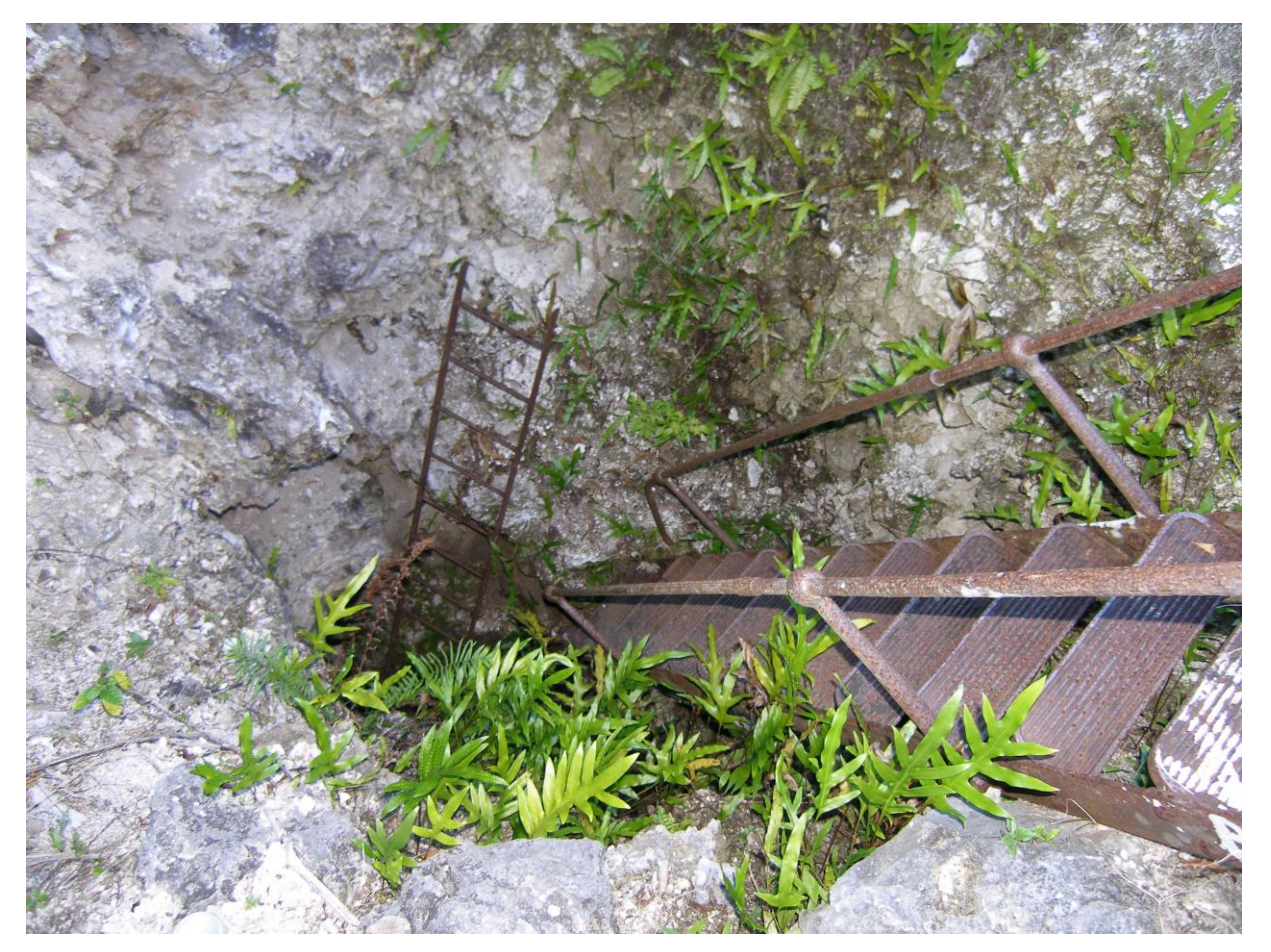
Figure 7. Entrance to an active well or water cave ( bwangabwanga ) with Microsorum grossum te keang ni Makin growing on the walls inland from stock pile on Topside of Banaba.

Although no technical reports are available, we observed the soils of Banaba, like those of Nauru, to be shallow, coarse-textured, presumably alkaline, and of carbonatic mineralogy. They are composed of a variable layer of organic matter and coral sand, gravel and fragments overlaying a limestone platform. Potassium levels are often extremely low, and pH values of up to 8.2 to 8.9 and high CaCO<sub>3</sub> levels make scarce trace elements, particularly iron (Fe), manganese (Mn), copper (Cu) and zinc (Zn), unavailable to plants. Calcium dominates the exchange complex and exchangeable magnesium is also high, while extractable phosphate values are generally high and sulphate moderate. Fertility is, therefore, highly dependent on organic matter for the concentration and recycling of plant nutrients, lowering soil pH, and for water retention in the excessively well-drained soils (Morrison 1987, 1994).