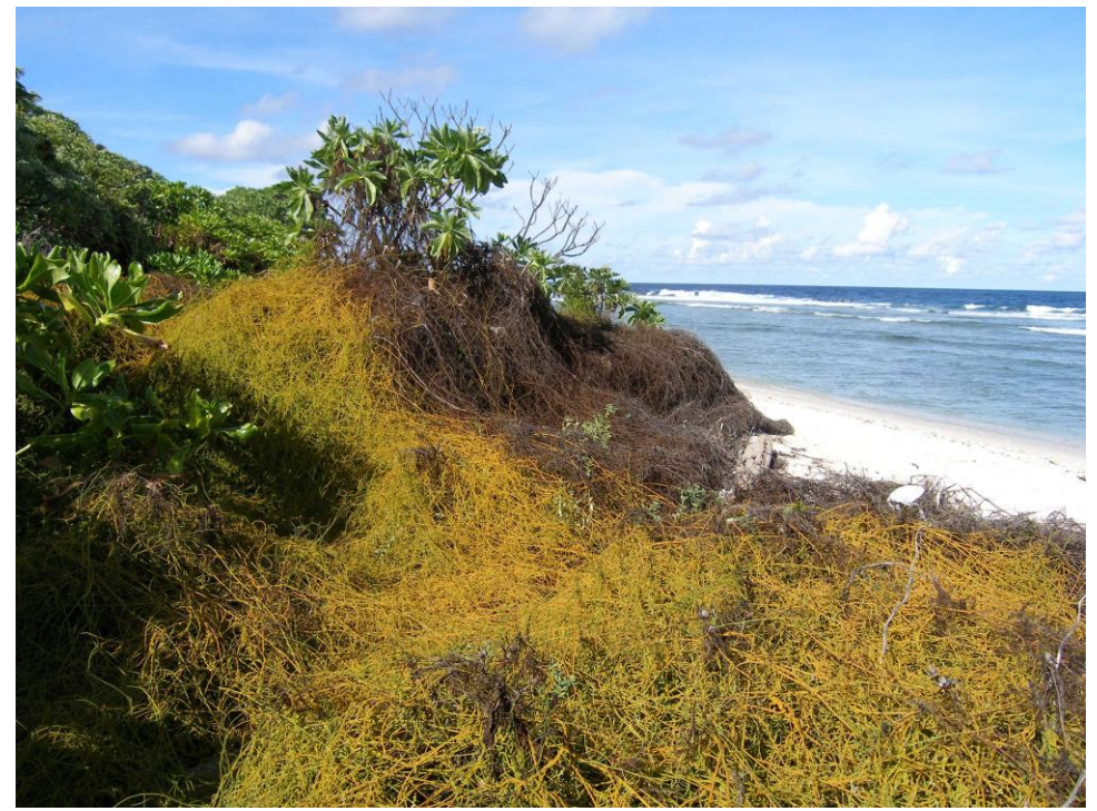
Figure 13. The leafless parasitic vine, Cassytha filiformis , spreading on coastal limestone and Scaevola taccada and Tournefortia argentea , Uma, southeastern Banaba.