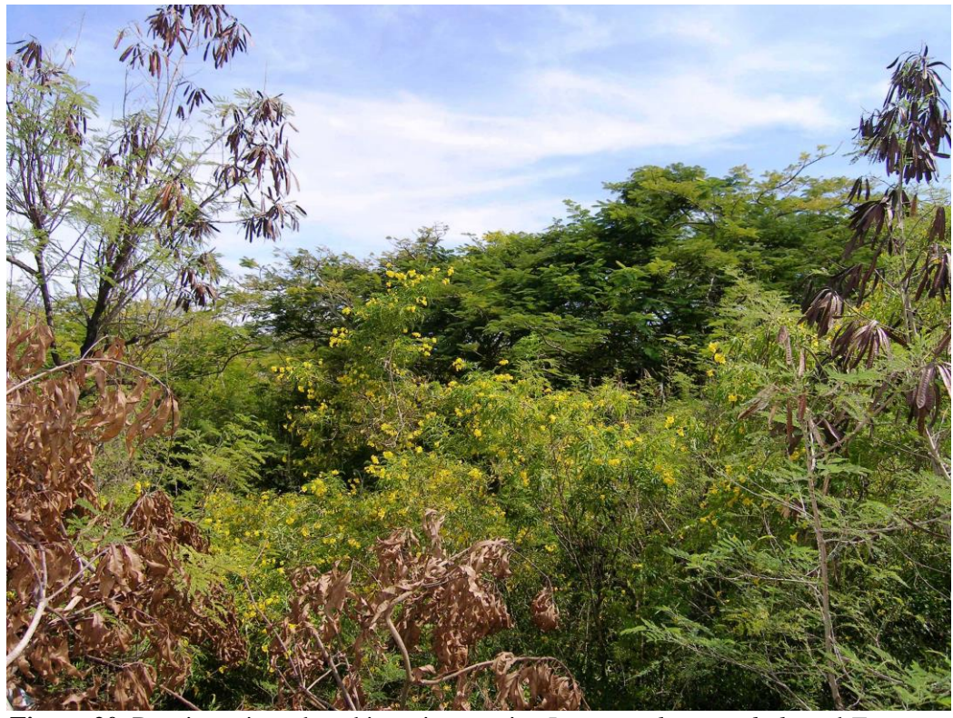
Figure 20. Dominant introduced invasive species Leucaena leucocephala and Tecoma stans (center, with yellow flowers) in secondary vegetation in degraded, mined-out areas, Banaba.