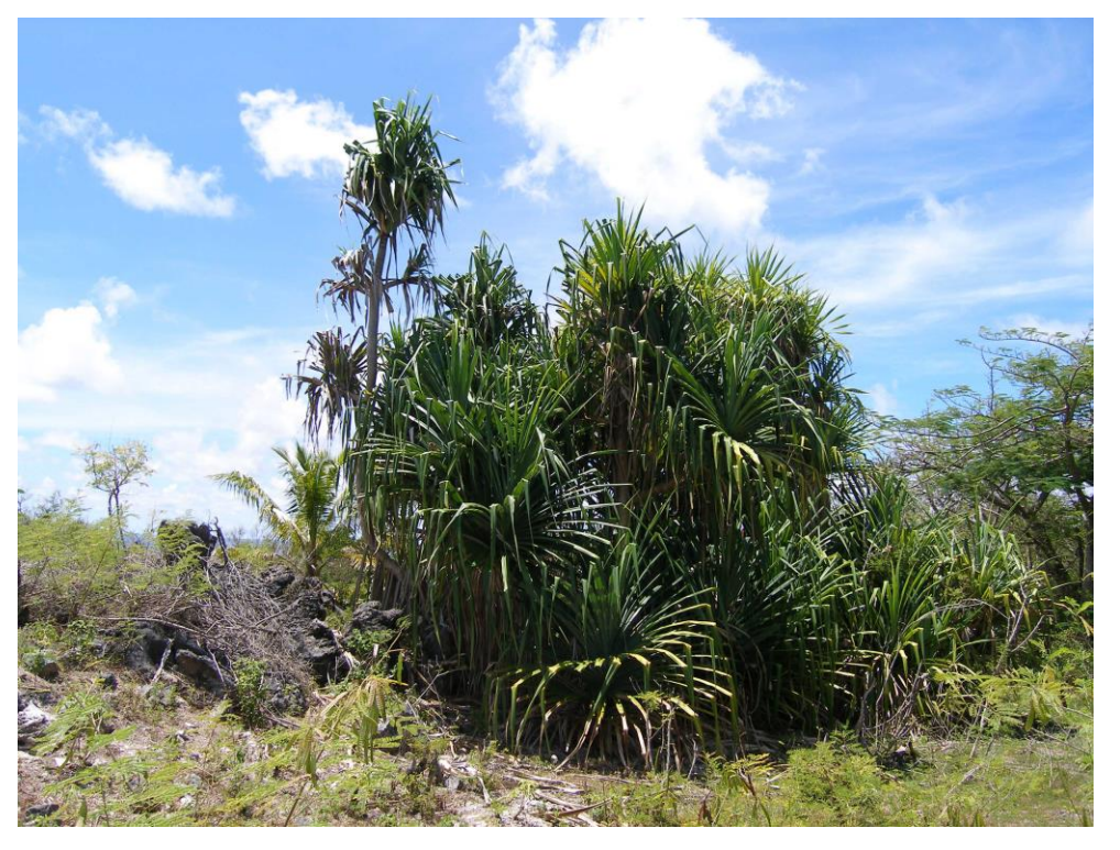
Figure 9. Planted edible pandanus te kaina Pandanus cultivar on land south of the cemetery (see Figure 3). Pandanus trees, coconut palms and other useful trees were traditionally gifted or inherited with land in Banaba.