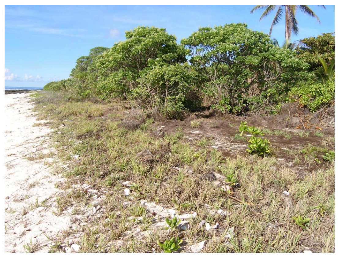
Figure 11. Coastal strand vegetation dominated by the grass Lepturus repens (foreground) and scattered Scaevola taccada shrubs and the taller Tournefortia argentea (background), Uma, southeastern Banaba.

The most common introduced species in this zone is leucaena te waiwai Leucaena leucocephala . Occasional species include pandanus te kaina Pandanus tectorius . A remnant individual te uri Guettarda speciosa tree, that had been severely cut, was seen on the inner margin of this zone in the southeast. The coconut palm te ni Cocos nucifera was conspicuously absent in this zone.