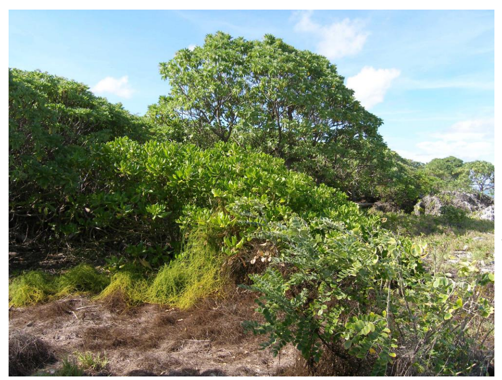
Figure 12. Sophora tomentosa (front right), Cassytha filiformis (front left), Scaevola taccada (center) and Tournefortia argentea (back) in coastal vegetation on coastal strip, Uma, southeast Banaba.