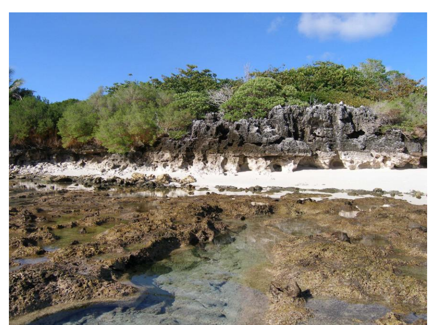
Figure 6. Intertidal flat and wave-cut limestone coastal terraces and coastal vegetation on north coast of Banaba.

The central upland inland from the cliffs consists of coral-limestone pinnacles and limestone outcrops, between which extensive deposits of soil and high-grade tricalcic phosphate rock used to be found before the long history of mining (Viviani 1970; Tyrer 1962; Taylor 2005).