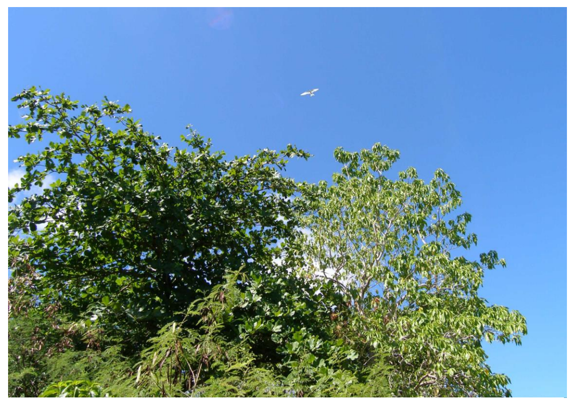
Figure 16. Remnant Terminalia catappa te kunikun and Pisonia grandis te buka forest in unmined area near Tabwewa inland from the north coast of Banaba.

Based on the small stands and remnant individual trees still found in the interior of the island on "topside" and similar studies of unmined forest on Nauru, the dominant upper canopy tree species of the central inland forest and woodland are te itai Calophyllum inophyllum (Figure 17), te kunikun Terminalia catappa , and possibly Millettia pinnata , which is very common in unmined areas around the Sports Ground (Figure 3) and the hand-mined areas to the northeast of Fatima. Also occasional as an emergent tree is te buka Pisonia grandis . Also possibly present as a component of this vegetation type in the past was the native banyan, te aioo Ficus prolixa , which was only seen on the margins of the settlement and in some of the mined areas in 2005, but was a common component, especially on emergent limestone pinnacles in Nauru (Thaman et al. 1994; Thaman et al. 2008a, 2008b).