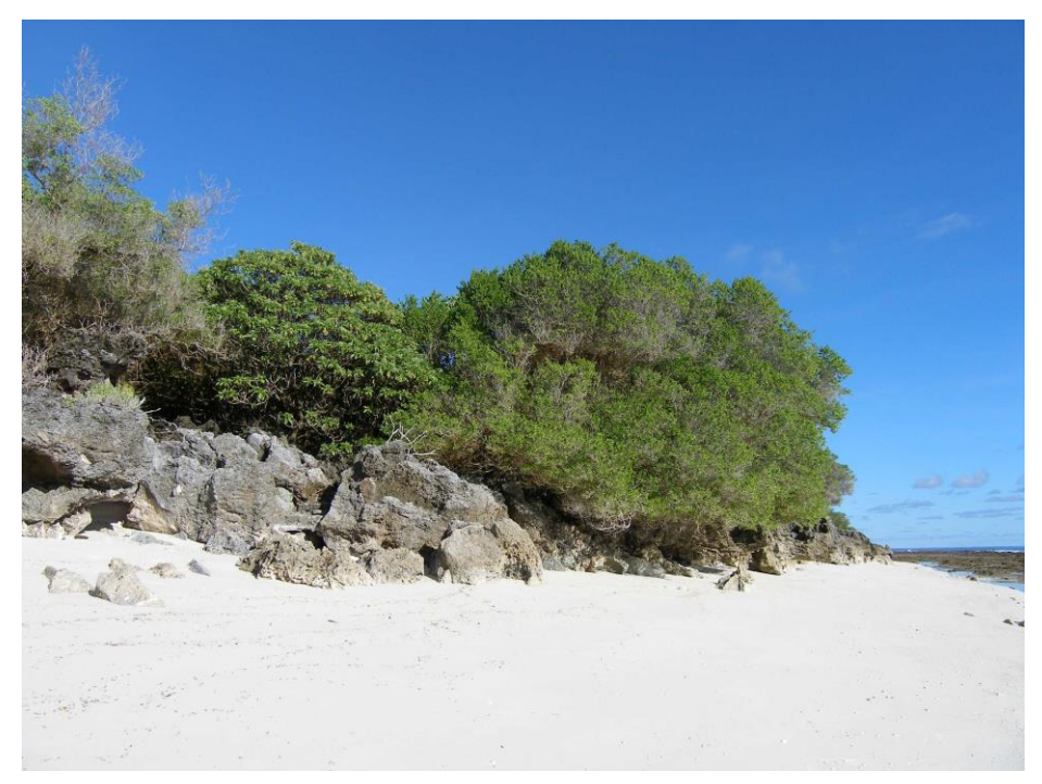
Figure 14. Tournefortia argentea (te ren; center) and Pemphis acidula (Te ngea) on limestone outcrop (left and right) along the inner beach, north coast of Banaba.