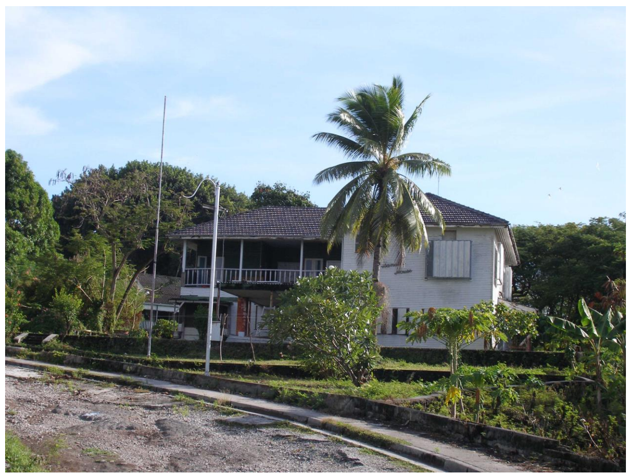
Figure 24. Coconut palm te ni Cocos nucifera , white frangipani te meria Plumeria obtusa , papayas and bananas ( Musa cultivars; in right foreground) at Banaba House.