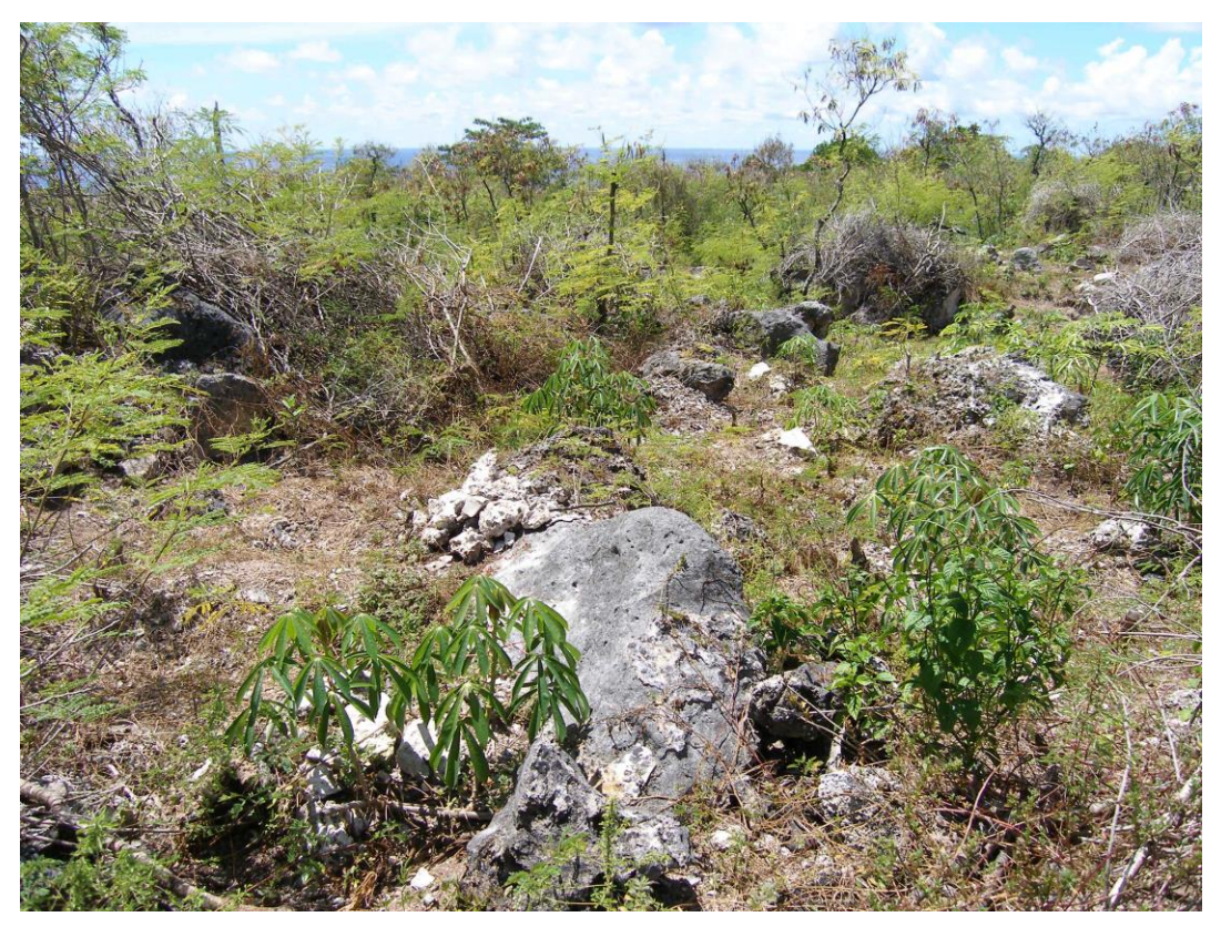
Figure 25. Cassava te tabioka Manihot esculenta , the main staple food crop planted in food gardens in the middle of the island south of cemetery.