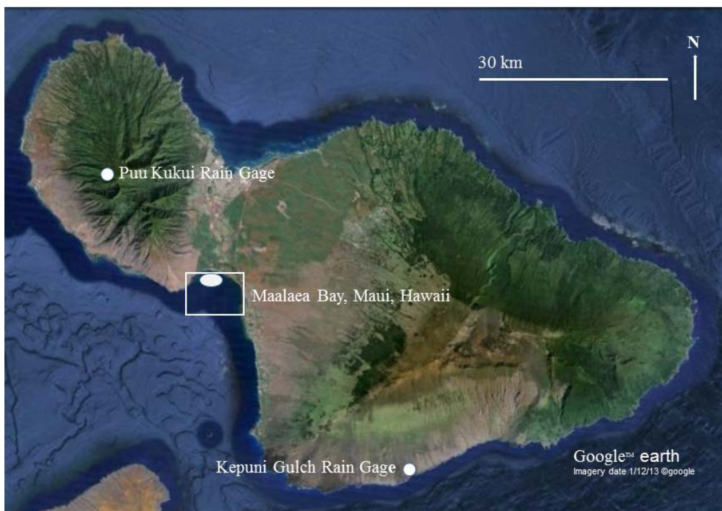
Figure 1. Maalaea Bay (square) and sampling site (oval), Maui, Hawaii, in relation to the local topography. The two rain gauges on Maui, Hawaii, are at Puu Kukui, Maui, Hawaii, in the north at 1,759 meters elevation and at Kepuni Gulch along the southwestern coast at 77.7 meters elevation ( http://hi.water.usgs.gov/recent/hawaii ). Data: LDEO-Columbia, NSF, NOAA, U.S. Navy, NGA, GEBCO. Image: Landsat. © 2014 Google.