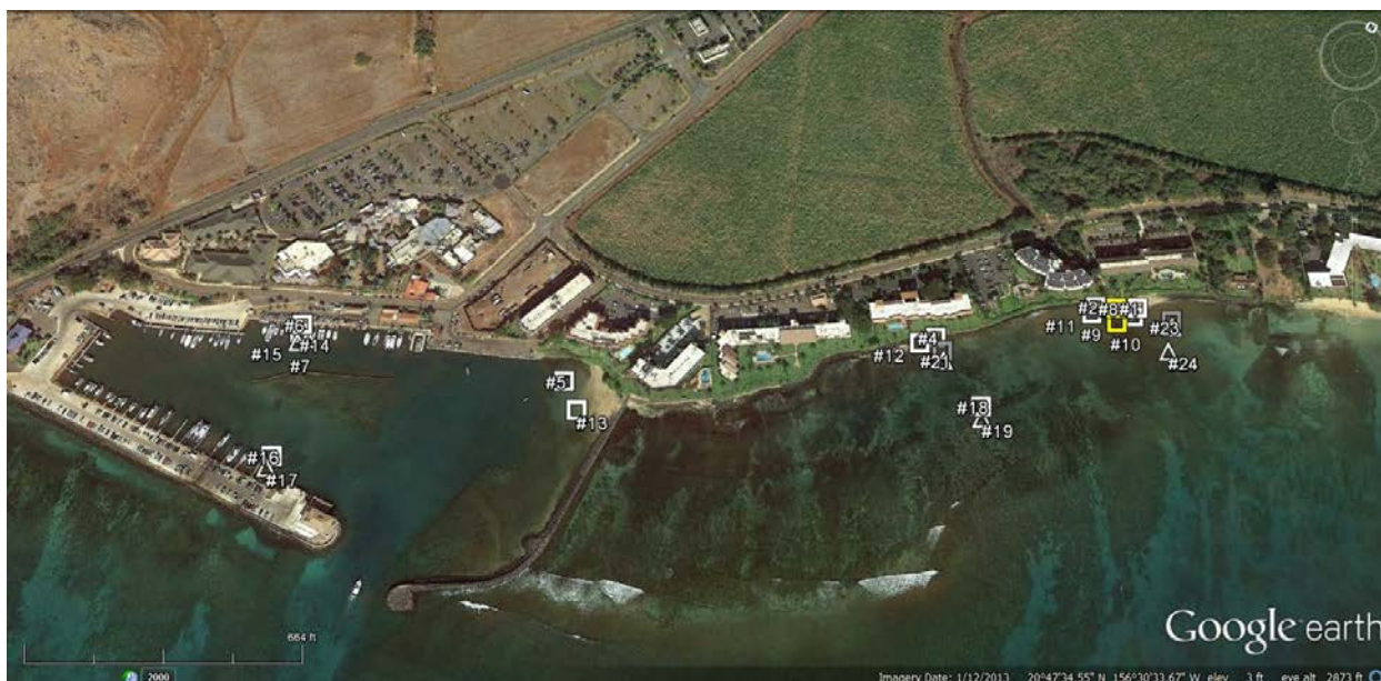
Figure 2. Sampling locations along Maalaea Bay, Maui, Hawaii. White squares indicate surface samples, white triangles indicate subsurface samples, and yellow squares mark stations that tested positive for Diuron in concentrations greater than 3 ppb (#8 and #9).