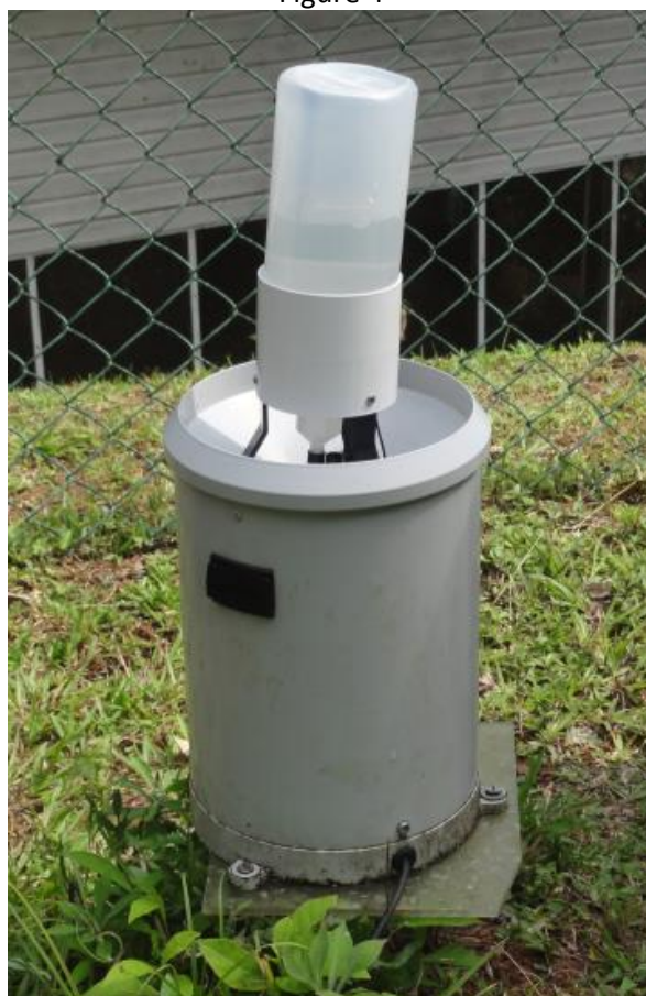
Tipping Bucket Calibration