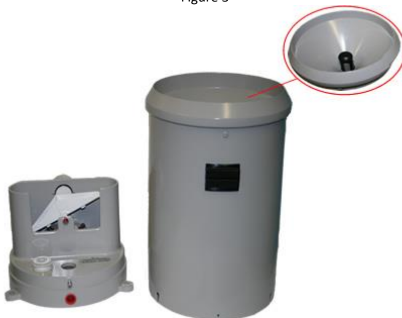
Hydrological Services Model TB3 tipping bucket