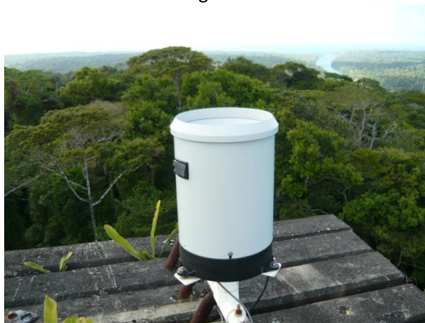
Tipping bucket on top of the Sherman crane.