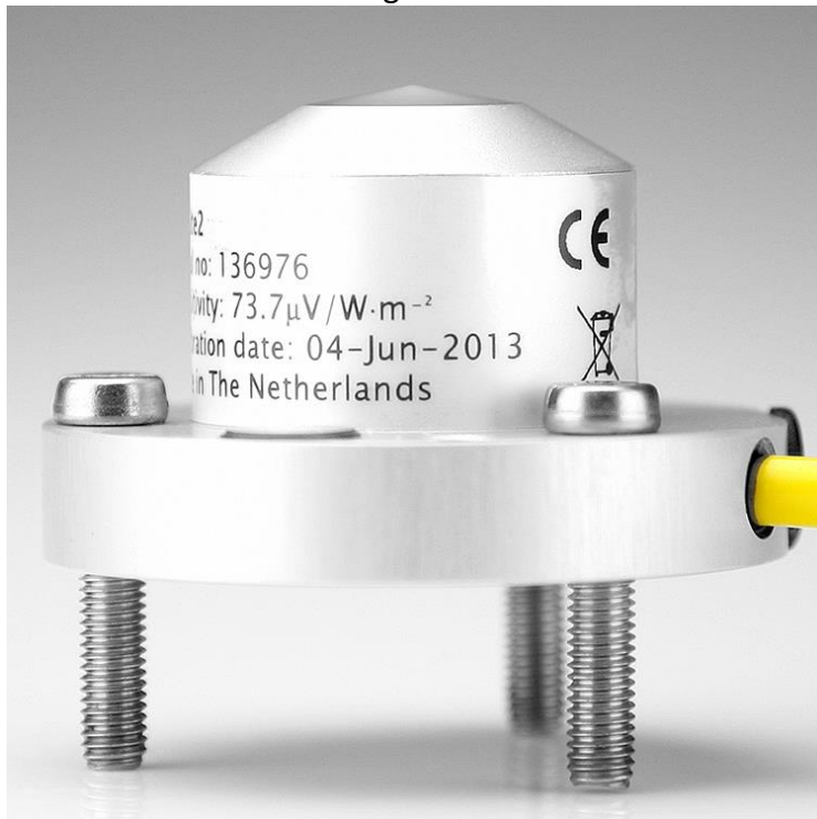
Kipp & Zonen SPLite2