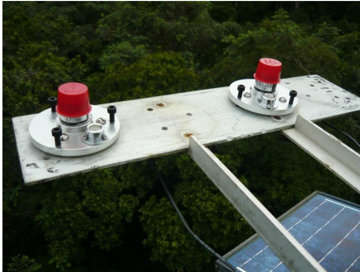
Paired Pyranometers (with protective caps used during installation)