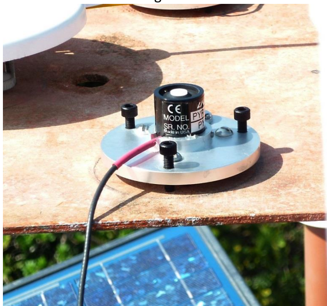
Close-up of LiCor Li200x Pyranometer