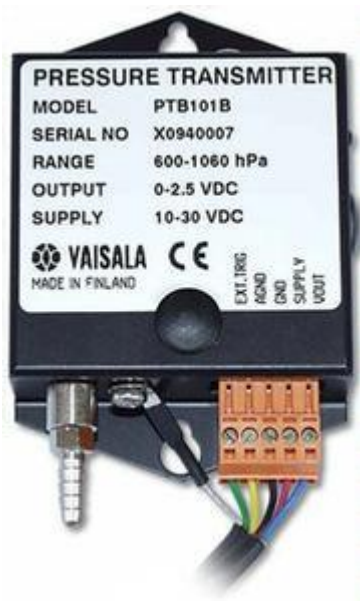
Vaisala PTB101B Barometric Pressure Sensor