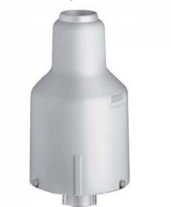
OTT Pluvio 2 S Rain gauge